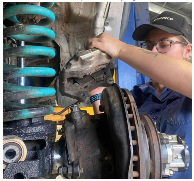
8. Undo Swivel Wipes (10mm bolts)

7. Remove brake calliper and unplug abs sensor and hang to the side